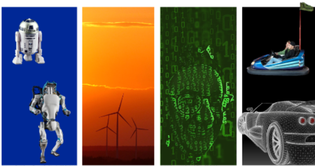
Bot arm