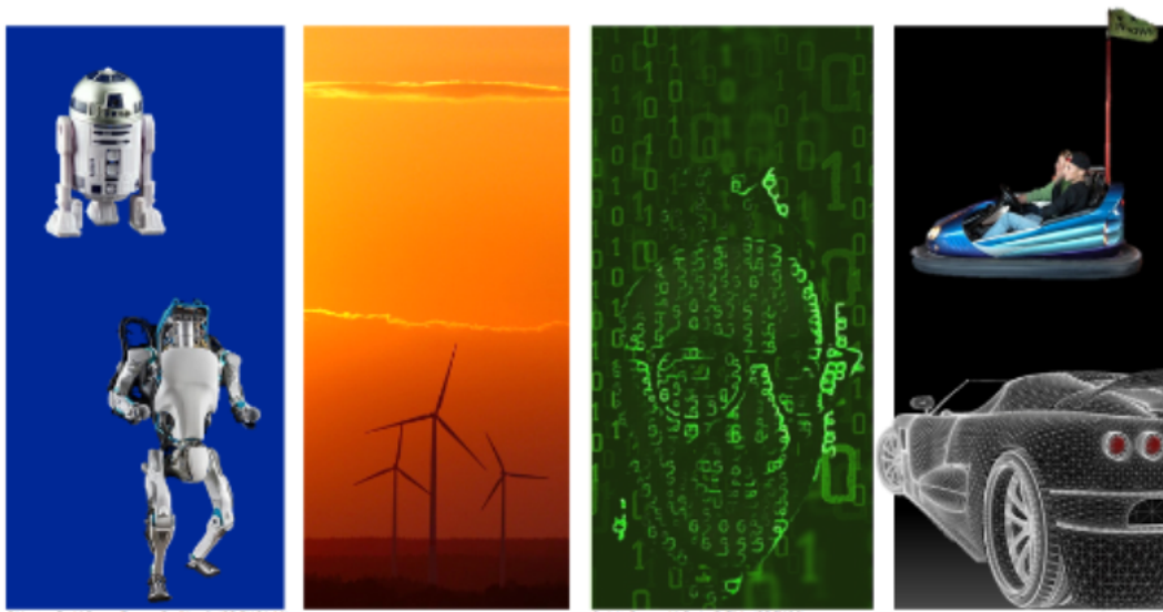
Big atom: David Carrera/Romero - @ wikimedia, CC BY-SA 4.0