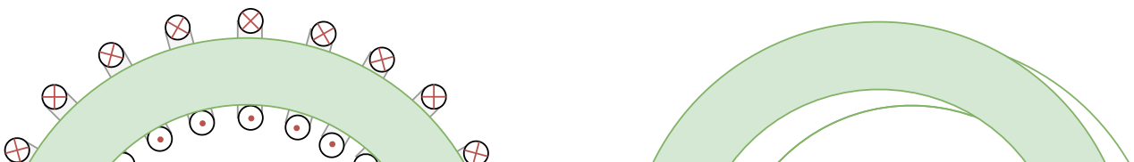
Fig. 18: Self-Induction of a toroidal Coil

The toroidal coil was analyzed in the last chapter(see magnetic Field Strength Part 1: Toroidal Coil ). Here, a rectangular intersection a assumed (see figure 18 ).