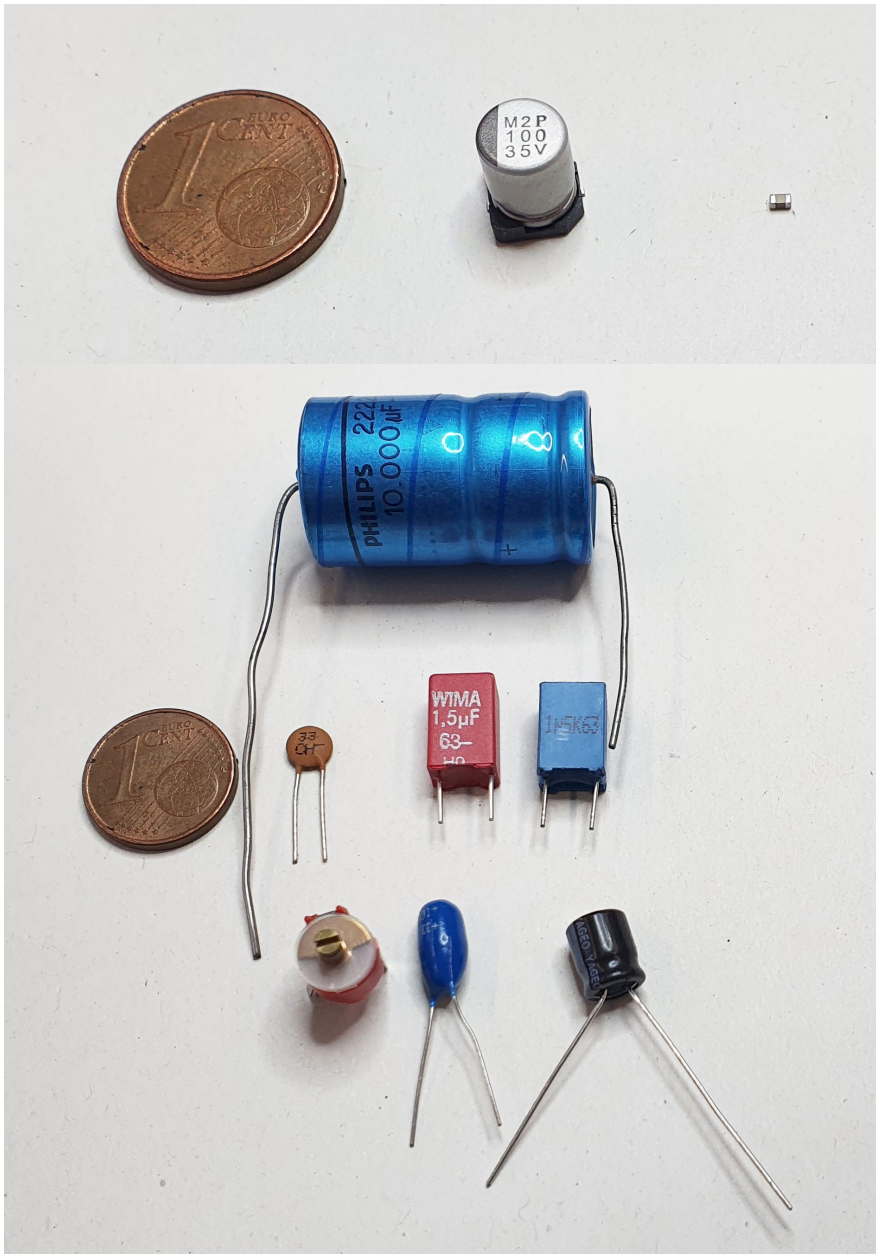
Fig. 2: types of capacitors

In figure 2 are shown different capacitors: