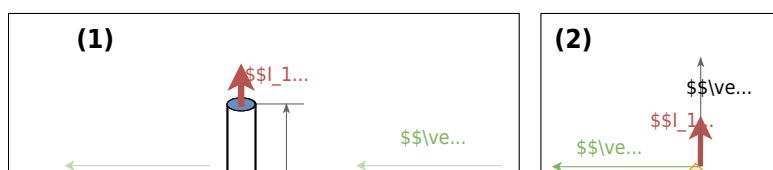
Fig. 2: Force onto a single Conductor in a B-Field