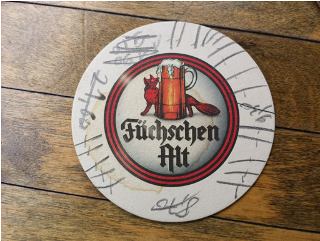
Fig. 1: number of drinks on a German Bierdeckel (coaster)

In ancient Rome these systems were deeper elaborated. There were different symbols which represent numbers of various sizes: