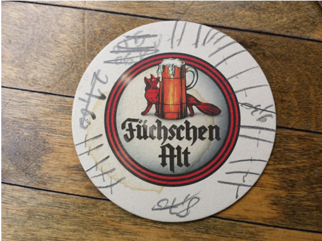
Fig. 1: number of drinks on a German Bierdeckel (coaster)

In ancient Rome these systems were deeper elaborated. There were different symbols which represent numbers of various sizes: