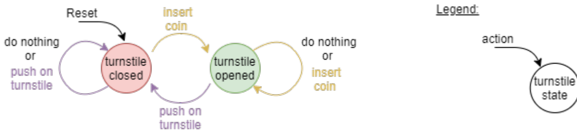
Fig. 12: State Transition Diagramm of the Entrance Control for Toilets

Out of this state transition diagram one can create a table-like representation, see figure 13.