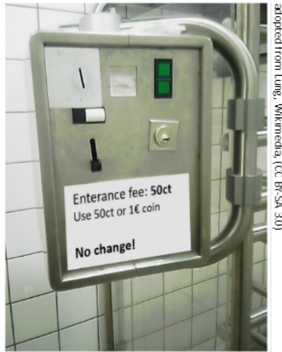
Fig. 11: Entrance Control for Toilets

The figure 12 the state transition diagram is drawn.