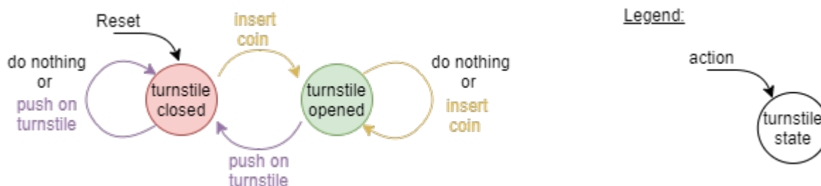
Fig. 12: State Transition Diagramm of the Entrance Control for Toilets

Out of this state transition diagram one can create a table-like representation, see figure 13.