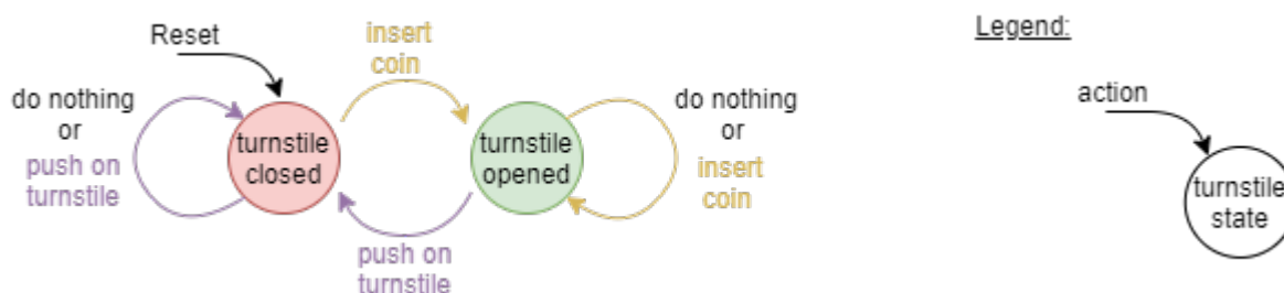
Fig. 12: State Transition Diagramm of the Entrance Control for Toilets

Out of this state transition diagram one can create a table-like representation, see figure 13.