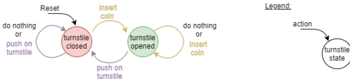
Fig. 12: State Transition Diagramm of the Entrance Control for Toilets

Out of this state transition diagram one can create a table-like representation, see figure 13.