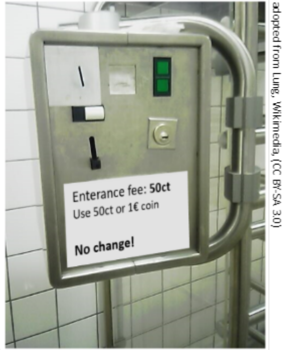
Fig. 11: Entrance Control for Toilets

The figure 12 the state transition diagram is drawn.