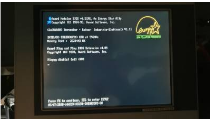
FROVIT 5200 - Test