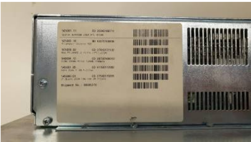
FROVIT 5200 - Bestückung