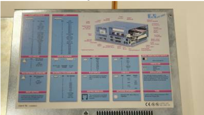
FROVIT 5200 - Bestückung Details