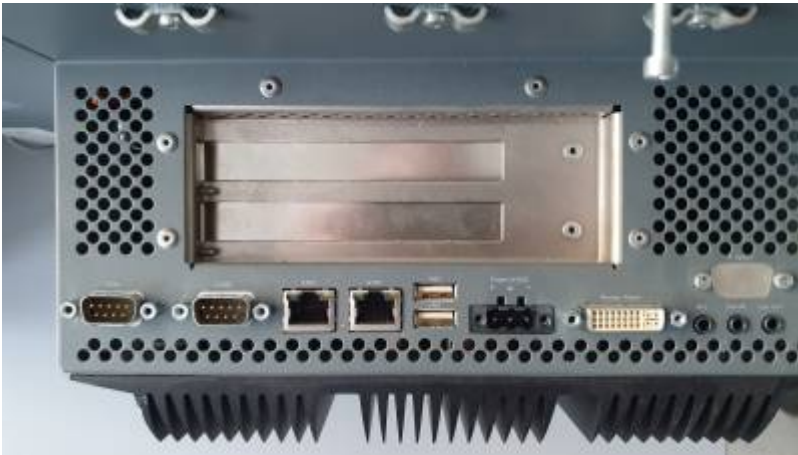
PANEL PC 5PC720 - Anschlüsse 2