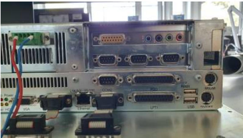
FROVIT 5200 - Anschlüsse 2