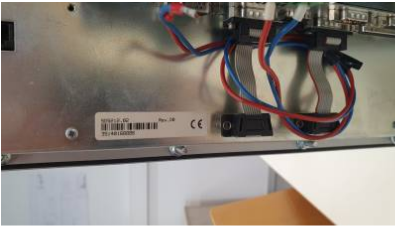
FROVIT 5200 - Anschlüsse 1