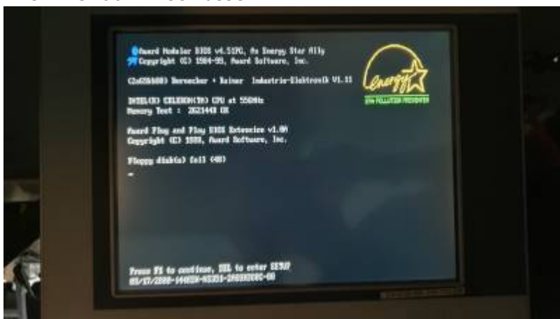
FROVIT 5200 - Test