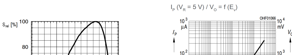
Fig. 3: Inverting Op-Amp: Diagramms of BPW 34 S