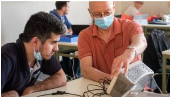
Fig. 1: ET1 Lab in SS2020